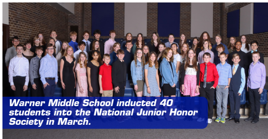
Warner Middle School inducted 40 students into the National Junior Honor Society in March.

PHOTO: The Warner Middle School IMPACT Service Club packed 24 Birthday Kits for students and families at Warner that might not have the resources to celebrate their birthdays! Kits include a cake mix, candles, and a card.