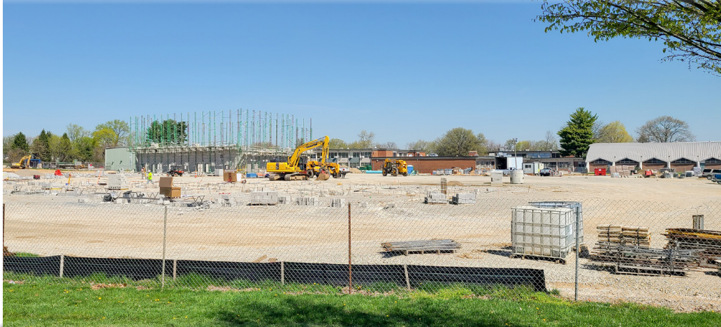
A view of the construction site in April 2023, with walls going up for the regulation gym in the background and the start of the Academic Wing visible in the foreground.

Now that the weather has warmed, the work to build the new Warner Middle School is moving ahead, with something new to see on the site each week. For those interested in a little more detail, here is a quick look at the projects to watch over the spring and summer!