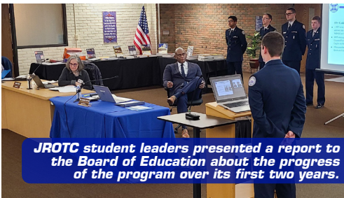
JROTC student leaders presented a report to the Board of Education about the progress of the program over its first two years.