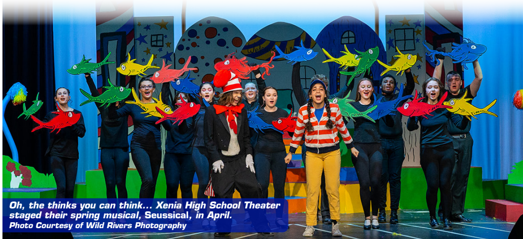
Oh, the things you can think... Xenia High School Theater staged their spring musical, Seussical , in April.