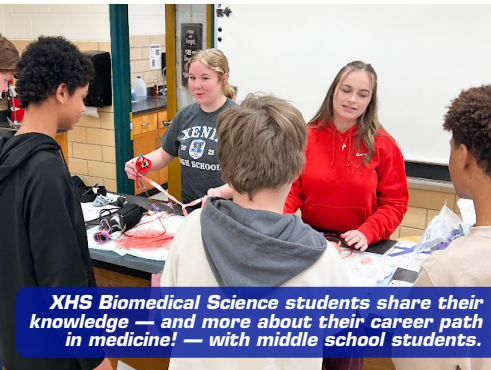
XHS Biomedical Science students share their knowledge — and more about their career path in medicine! — with middle school students.