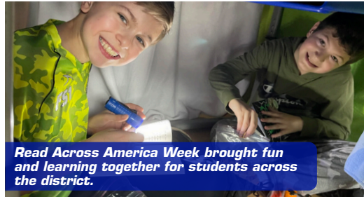
Read Across America Week brought fun and learning together for students across the district.