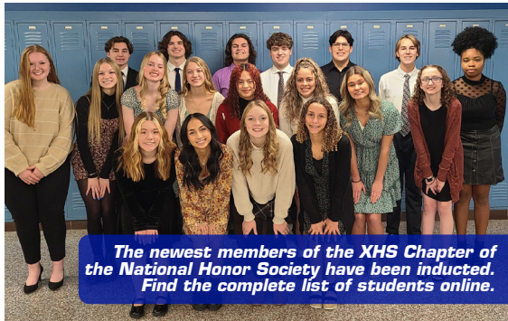
The newest members of the XHS Chapter of the National Honor Society have been inducted. Find the complete list of students online.