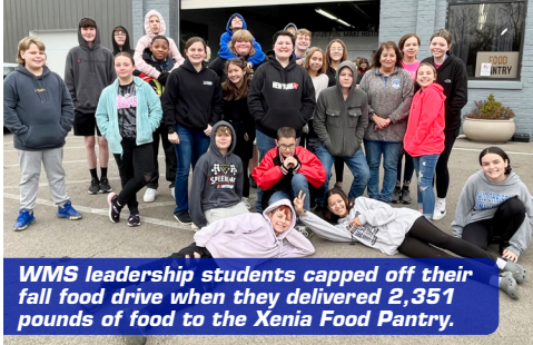
WMS leadership students capped off their fall food drive when they delivered 2,351 pounds of food to the Xenia Food Pantry.