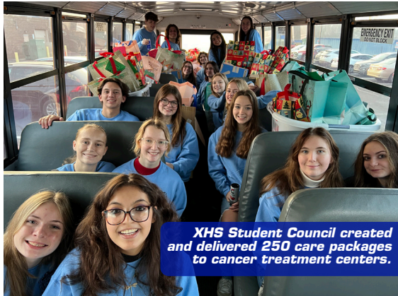
XHS Student Council created and delivered 250 care packages to cancer treatment centers.