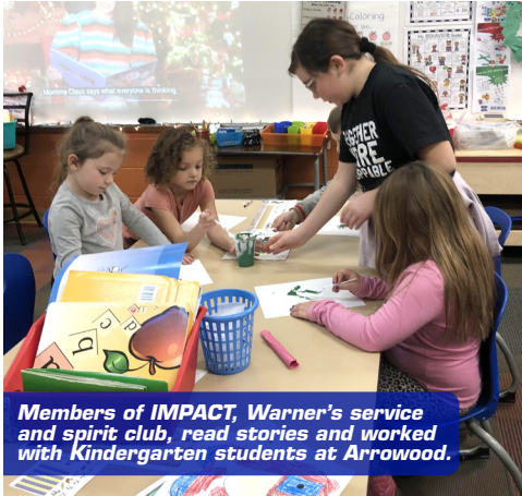
Members of IMPACT, Warner's service and spirit club, read stories and worked with Kindergarten students at Arrowood.