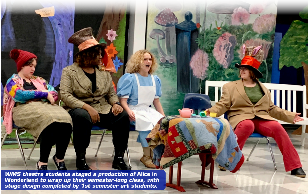
WMS theatre students staged a production of Alice in Wonderland to wrap up their semester-long class, with stage design completed by 1st semester art students.