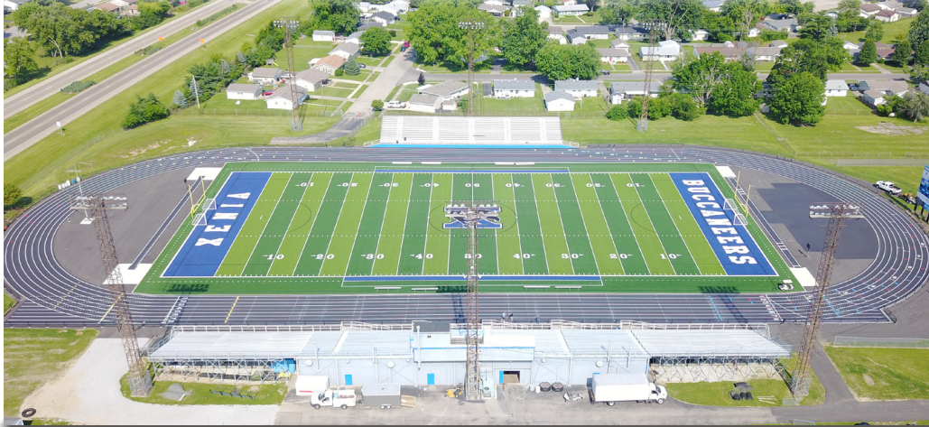
A view of Doug Adams Stadium from above.

The district’s newest construction project is one that has been on the minds of parents and student-athletes, a renovation at Doug Adams Stadium to include lighting, bleachers, press box, and parking.